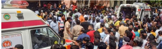
ANI MP/CG/Rajasthan @ANL_MP_CG_RJ Follow

The chief minister on Friday ordered an inquiry and also relief Rs 5 lakh as relief for the kin of the deceased and Rs 50,000 for the injured.